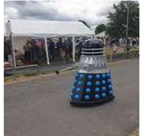
Looking for the storm trooper...