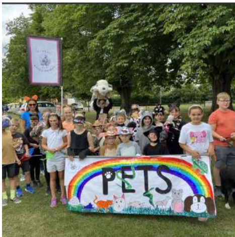
Primary School walking float