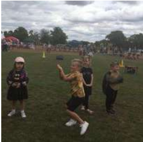
Fancy dress winners 5,6, & 7 yr olds