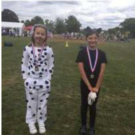
Fancy dress 8,9,10 & 11 yr old winners