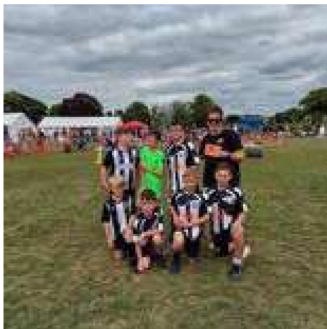
3rd Prize winner Isleham youth footballers