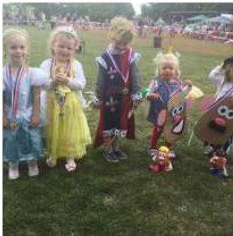
Fancy dress preschoolers winners