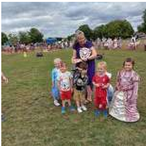
Float winner 1st place Isleham Pre School