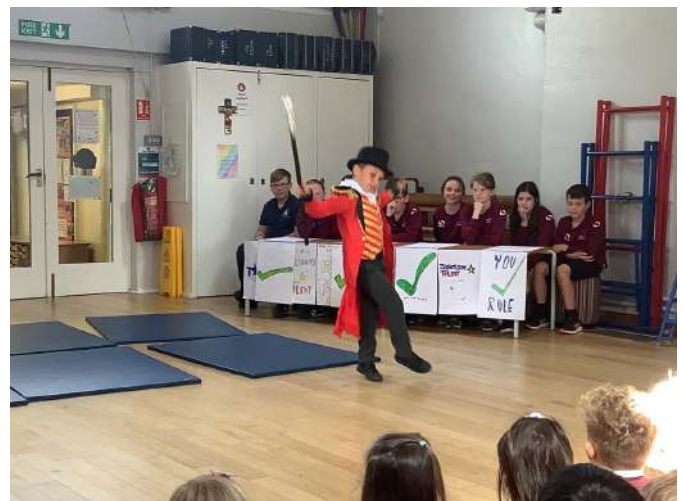
Isleham's got talent