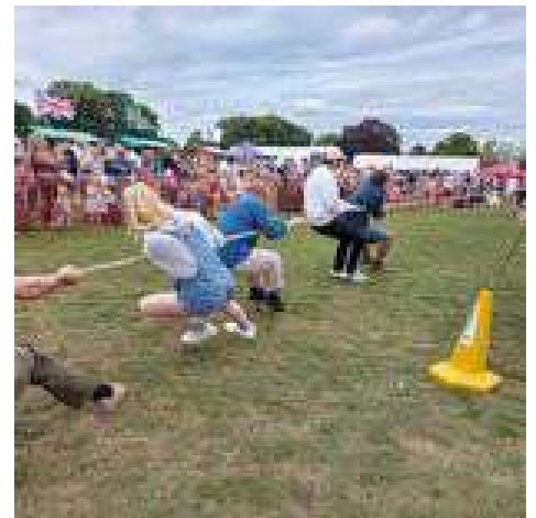
Tug o war