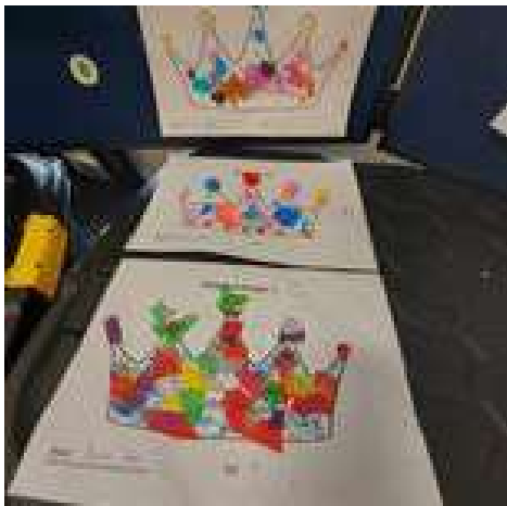
The three winners of the crown art competition.