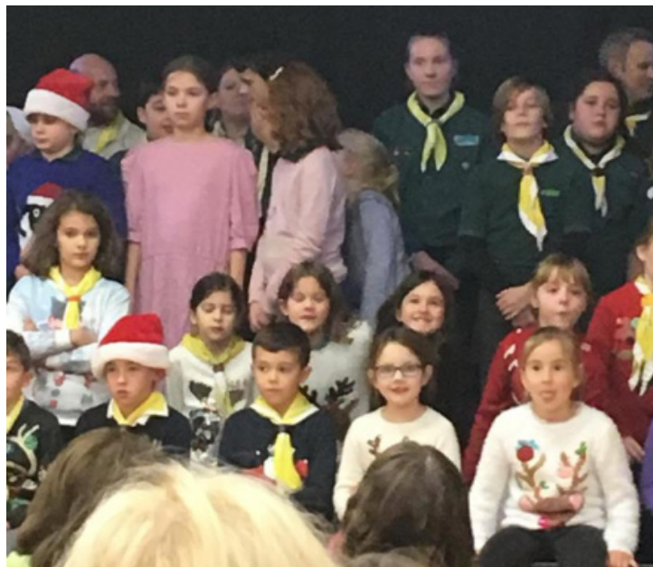
Photo of some of the beavers, cubs and scouts during our Christmas show 2018

We have seen a rise in our young leaders' numbers offering us more support within the sections. However we are on the look out for anyone who would like to come on board as an assistant leader with our cub section. They are a very active section doing many fun and exciting things. We are looking for someone with a passion to share with the youth of today and to be instrumental in the shaping of the adults they will become. This can come in the shape of teaching them new games (maybe even ones we played ourselves as youngsters) willing to committing to helping out at least twice a month at our weekly meetings on a Tuesday evening 6.30-8pm. If this could be you then please contact me at gsl@isleham-scouts.org.uk