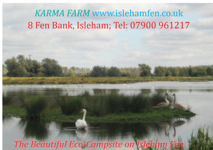
The Beautiful Eco-Campsite on Isleham Fen