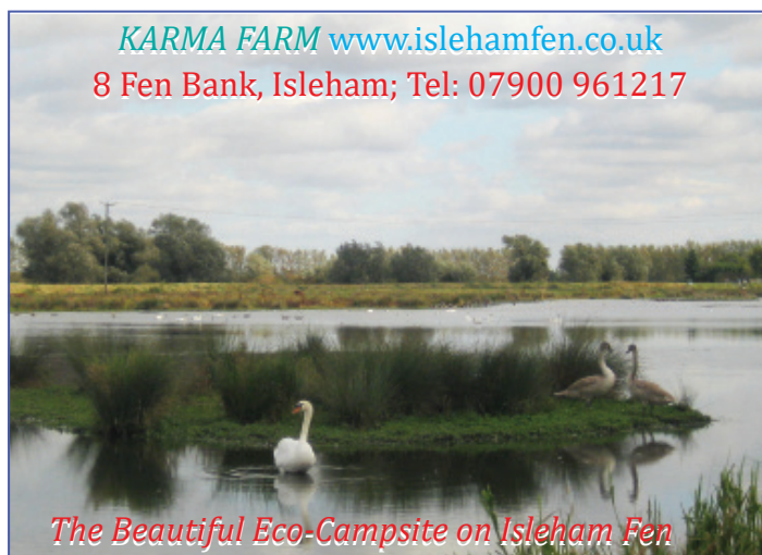
The Beautiful Eco-Campsite on Isleham Fen