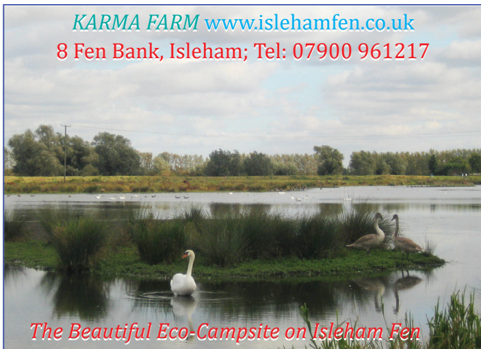
The Beautiful Eco-Campsite on Isleham Fen