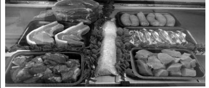
A new pack will be available each month – see Roseanna Thompson on Facebook for details.

An example of a TFM Best Buy Pack ONLY £25! 2 pork steaks, 1lb diced pork, 1lb hand-made chipolatas, 1lb lean beef mince, 2 gammon steaks, 6 eggs