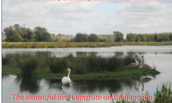
The Beautiful Eco-Campsite on Isleham Fen