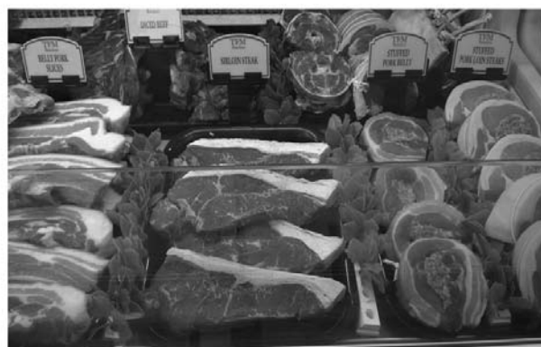
Our Fresh Meat Display in our On-Farm Butchers Shop at Fenrose Farm.

Buy British Buy local Buy from the farm gate