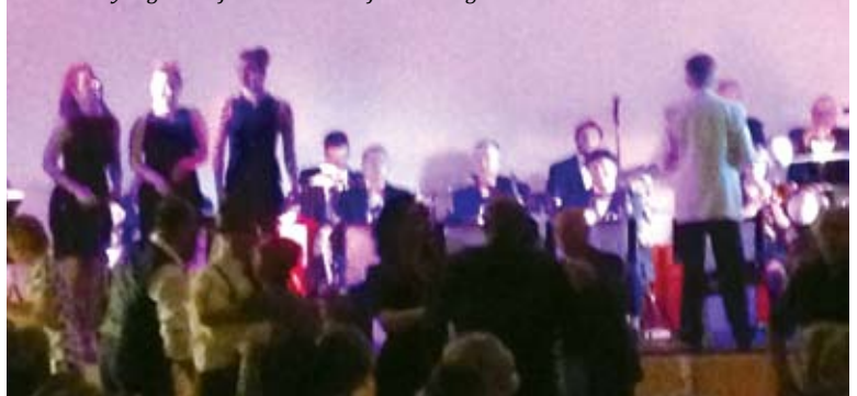
The Galaxy Big Band filled the dance floor all night

ALSO... GALA ROYAL FAMILY • FOOTY GIRRLS TRIUMPH AGAIN • GALA COMPETITIONS DETAILS INSIDE