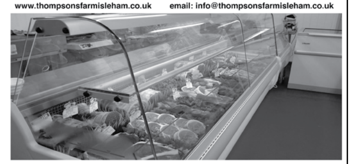
TFM's Fresh Meat Display Counters

Fenrose Farm, 1 Fen Bank, Isleham CB7 5SL Tel: 01638 780994 / 01638 780431