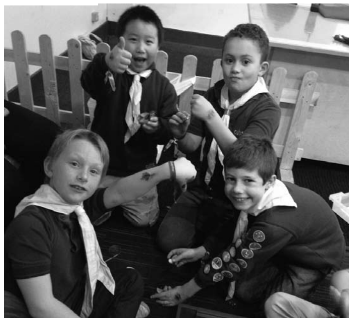
Below right: fake but very convincing wounds and bruises