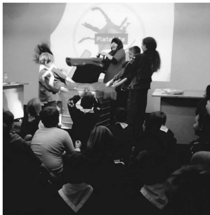
Below left: At the Science Museum sleepover, learning about haemoglobin with a leaf blower and balloons!