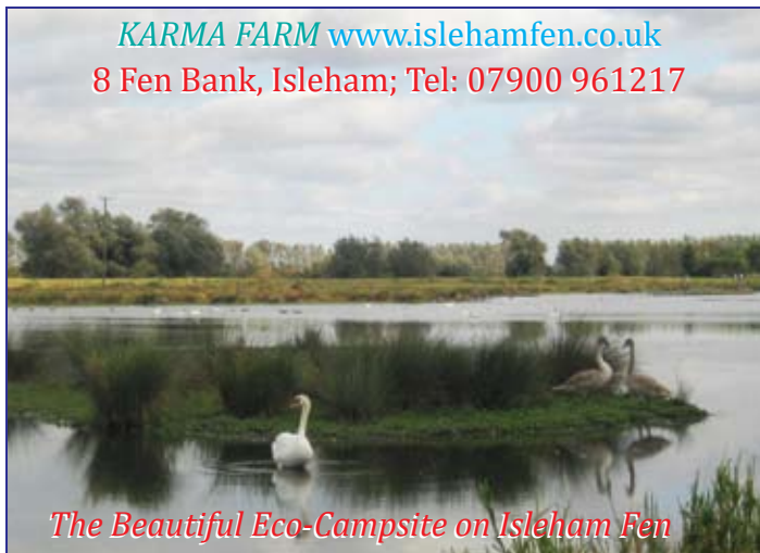
The Beautiful Eco-Campsite on Isleham Fen