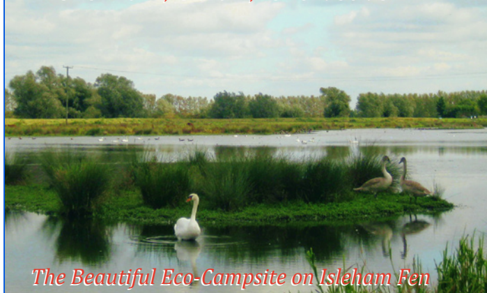
The Beautiful Eco-Campsite on Isleham Fen