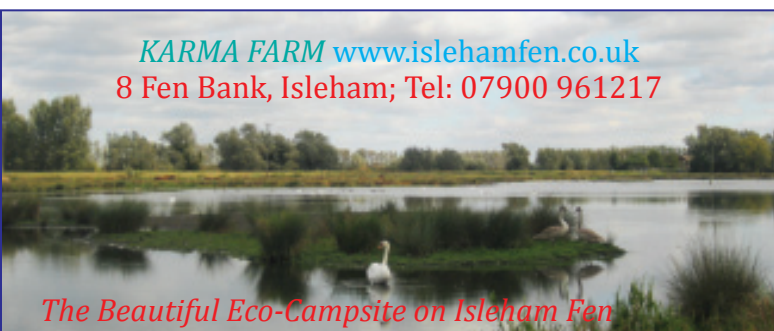
The Beautiful Eco-Campsite on Isleham Fen

KARMA FARM www.islehamfen.co.uk 8 Fen Bank, Isleham; Tel: 07900 961217