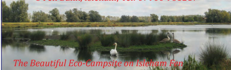
The Beautiful Eco-Campsite on Isleham Fen