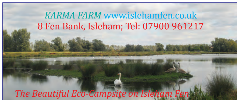
The Beautiful Eco-Campsite on Isleham Fen

KARMA FARM www.islehamfen.co.uk 8 Fen Bank, Isleham; Tel: 07900 961217