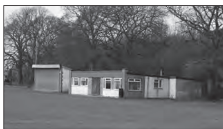
Will be replaced by this: