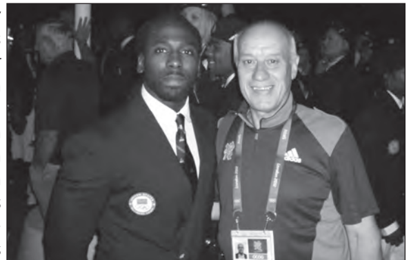
With Team USA Weightlifter Kendrick Farris