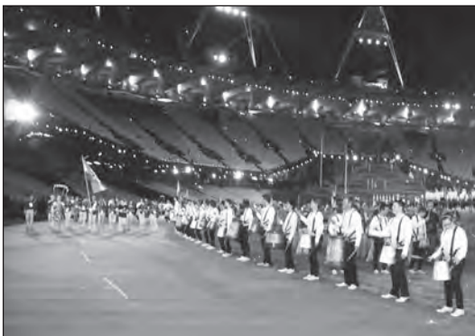
Final rehearsal for the Opening Ceremony