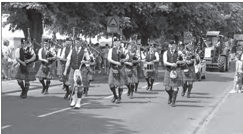
Photos of 2010 Gala

Tel: 01638 780104, email rusts@medimmue.com