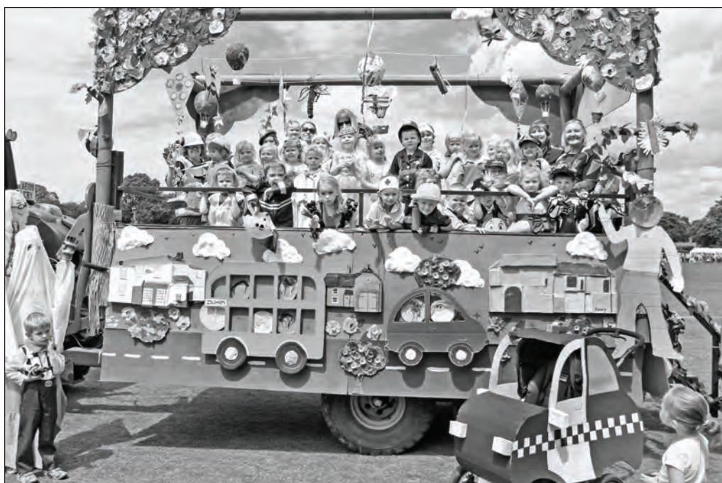
All Gala by photos by Vernon Place