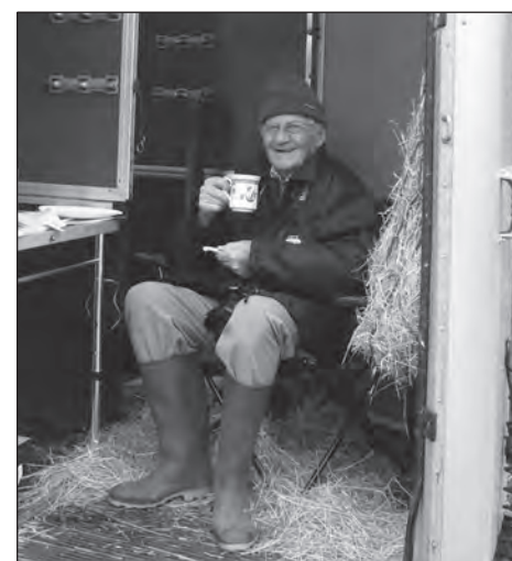
Does anyone know this man? It is believed that he has never been photographed before.