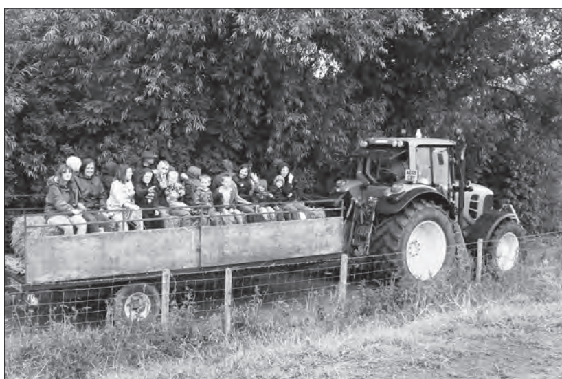
MOST (1) photos by Vernon Place