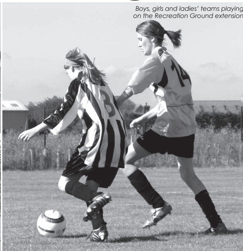
Boys, girls and ladies' teams playing on the Recreation Ground extension