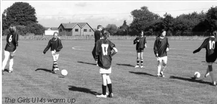
The Girls U14s warm up