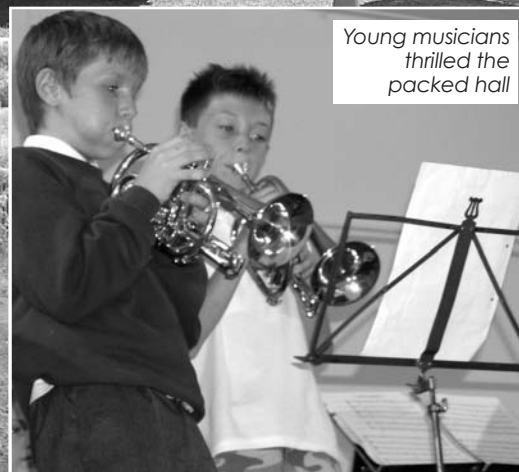
Young musicians thrilled the packed hall