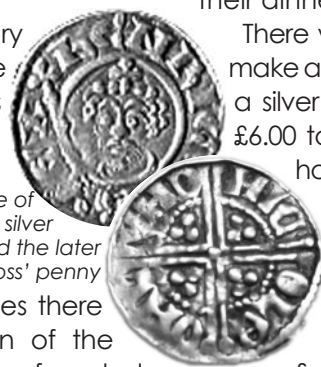
An example of a Henry II silver penny, and the later 'Long Cross' penny