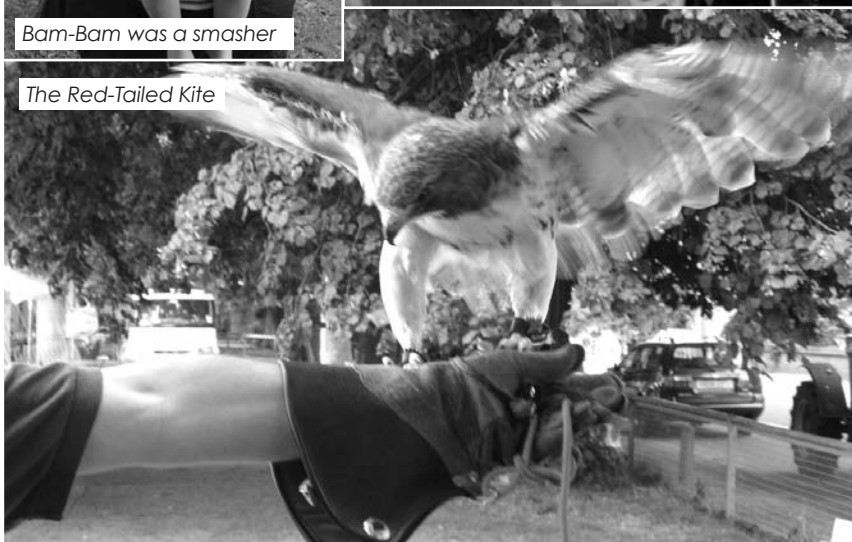
The Red-Tailed Kite