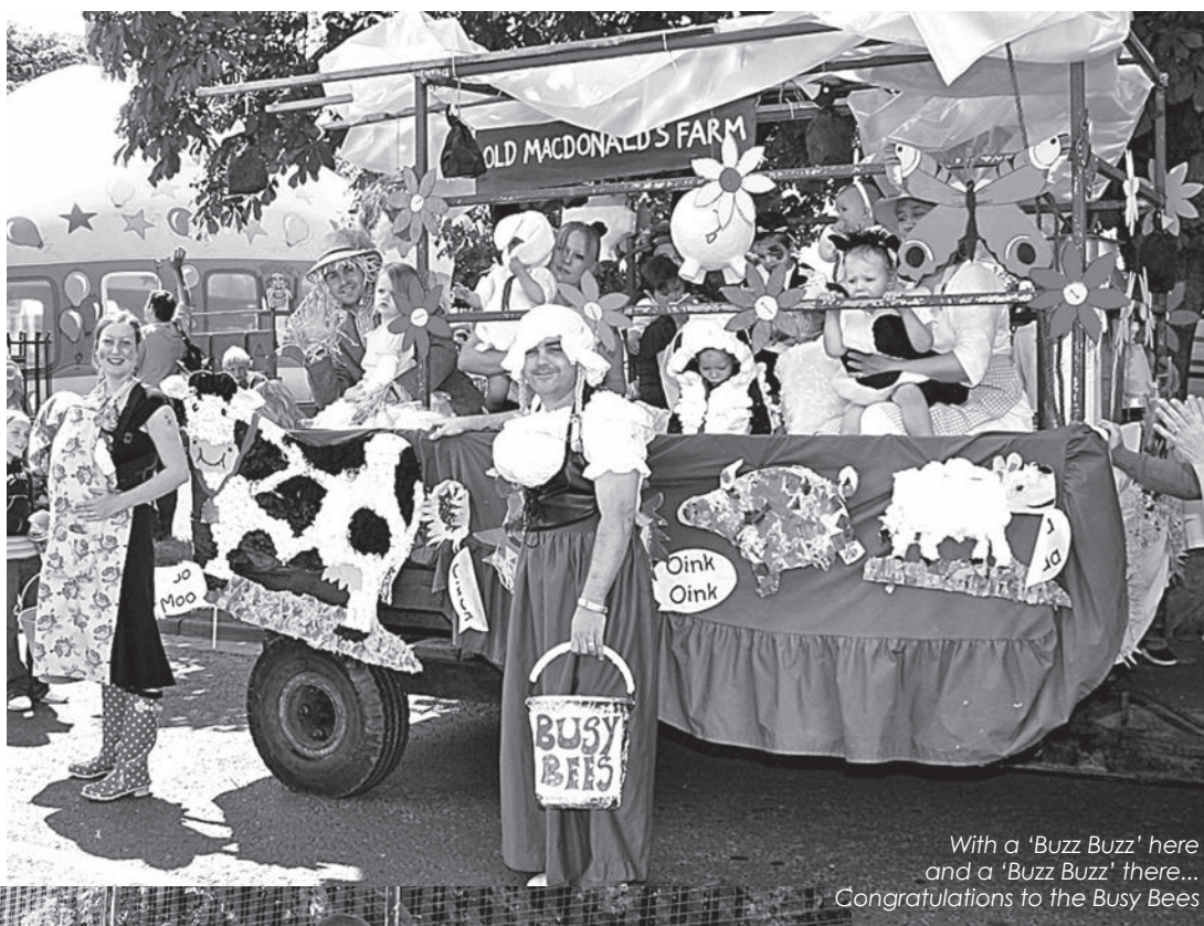
With a 'Buzz Buzz' here and a 'Buzz Buzz' there... Congratulations to the Busy Bees