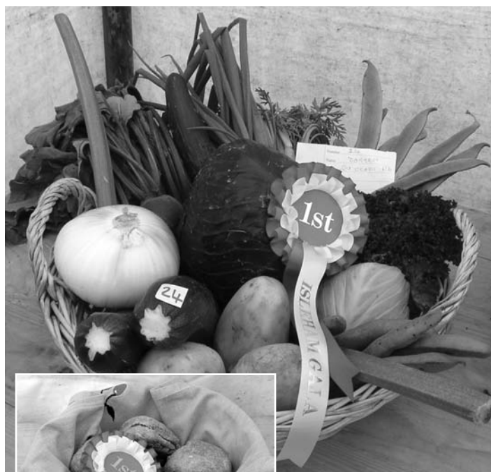
A Country Garden on a Plate 1st Kieran Pawson 2nd Phoebe Fallon 3rd Jack Cummins