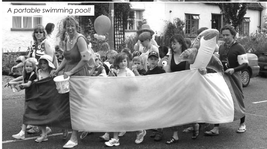
A portable swimming pool!