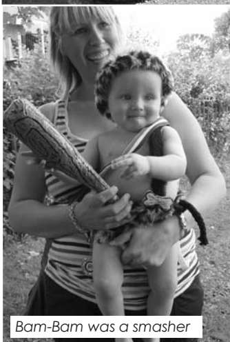
Bam-Bam was a smasher