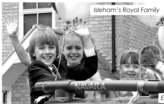
Isleham's Royal Family

'In the village, for the village, children first'