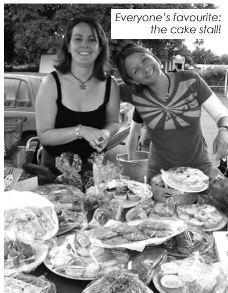
Everyone's favourite: the cake stall!

We have compiled a DVD of previous Gala Days starting from 1992 and covering most of the years up to 2006 which lasts about 60 minutes. If you would like to buy a copy for only £5.00 then please contact Russell Milne on 01638 780186 or e-mail russell.milne@talktalk.net