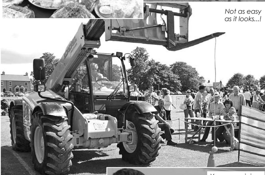
Not as easy as it looks...!