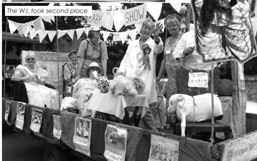
The W.I. took second place