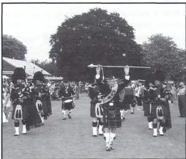
Our regular Pipe Band

Over 25 prizes kindly donated by an Isleham resident