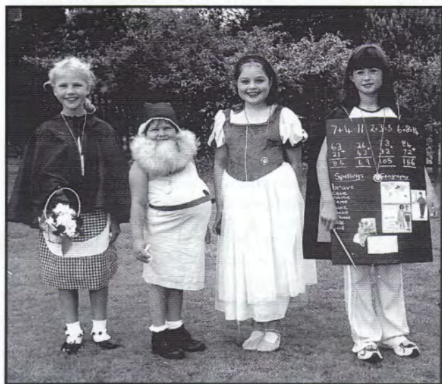
Some of the "Fancy Dressers"