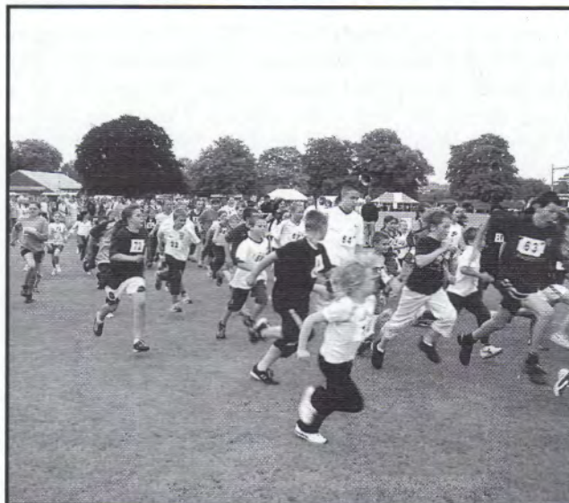
Start of the Fun Run